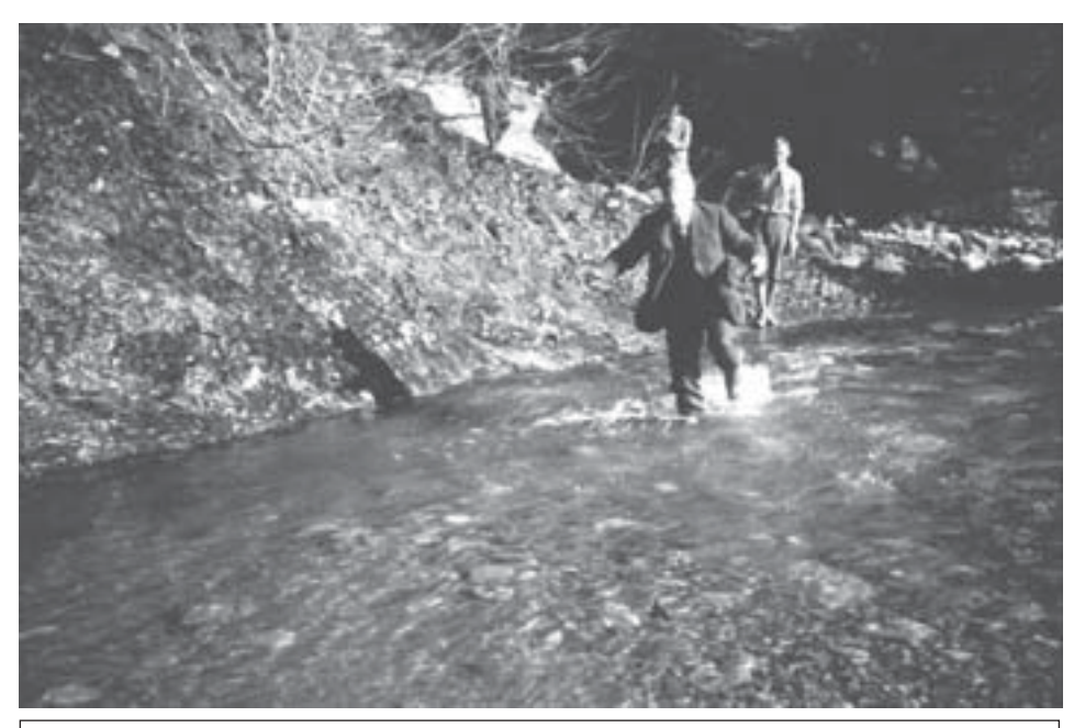
Gravel aggradation in the Fraser River system has communities worried about flood hazards. Above, Geography professor attempts to stop gravel from washing downstream.

Church's group has been working for some years now on refinements of the sediment budget for the reach so that the real magnitude of the problem can be appraised. Result: not so serious as feared (the actual gravel transport is modest), but gravel tends to pile up in certain places, producing locally high water levels. That finding has led to new research on the growth of the bars and deformation of the river channel by PhD student Darren Ham. An apparent solution to the whole problem would be to remove gravel from the river — the aggregate industry is actually anxious to do so. The problem is that the gravel movement is the key to the maintenance of salmon habitat along the river. Manipulation of the gravel