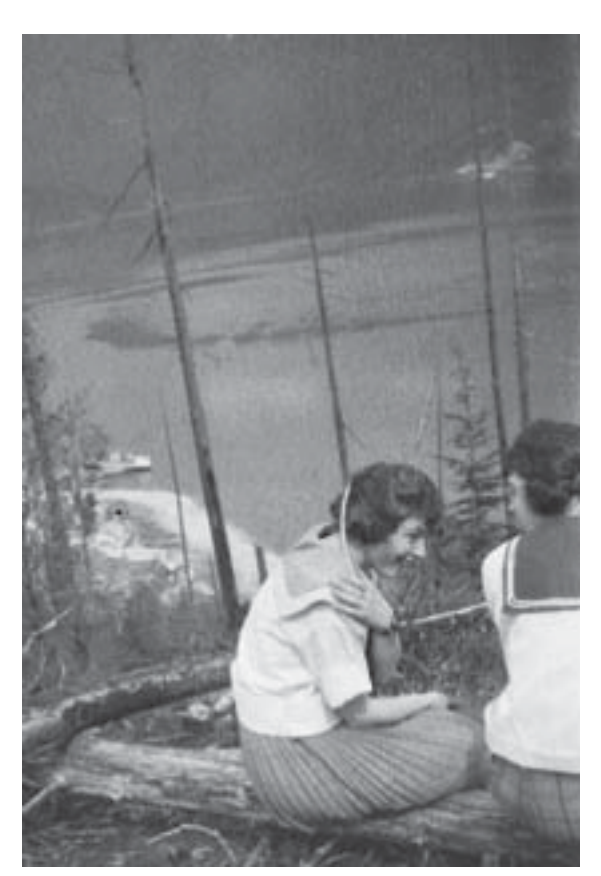
Toward a sense of place . . . Early UBC students, above, on a field trip near Deep Cove. The university Archives has discovered a cache of old photos from UBC's Fairview Shacks days and posted them on the web. They show students and faculty going about their day-to-day business, and are a fascinating window into the past. Visit the site at www.library.ubc.ca/