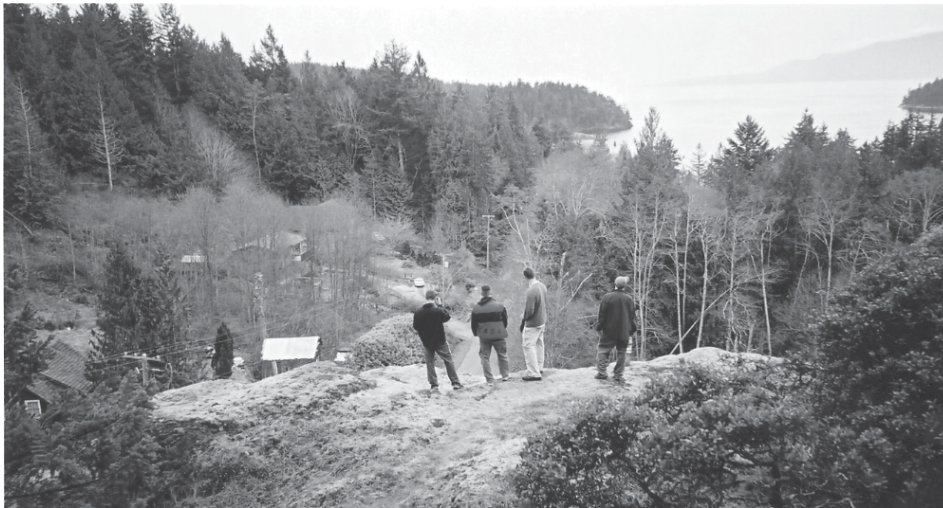
(Above) Taking in the panoramic views from Pender Hill. (Below) The Skookumchuk Narrows in maximum flood state.

Sunshine Coast Weekend (March 5-6, 2005)