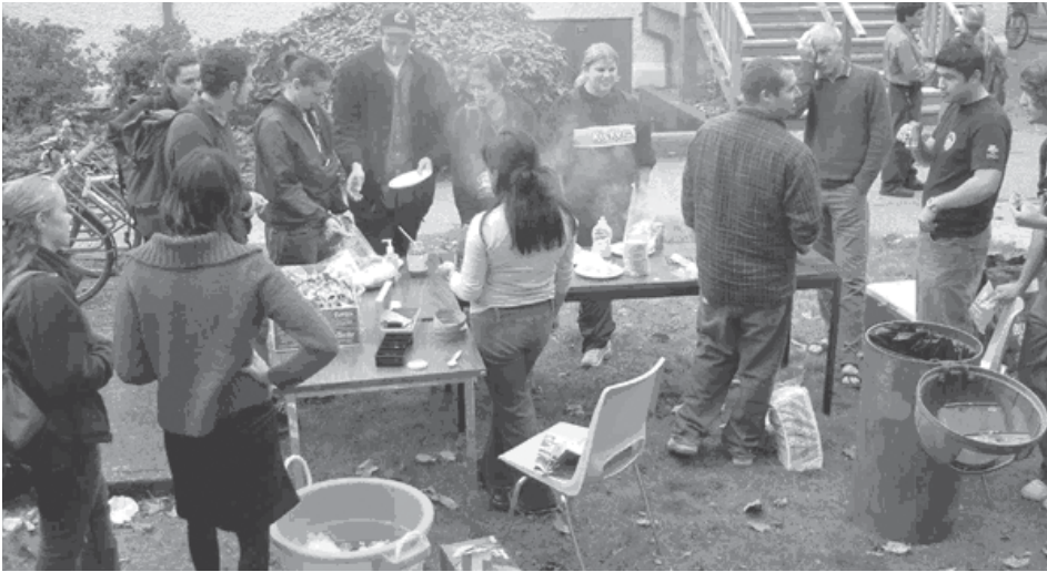
The GSA have invested in a state-of-the-art hibachi