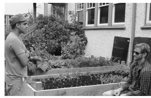
Volunteers enjoying the social space created by the garden

Interested in volunteering or learning more? Contact the team at ubcgeogarden@gmail.com and check out their blog at ubcgeogarden.wordpress.com.